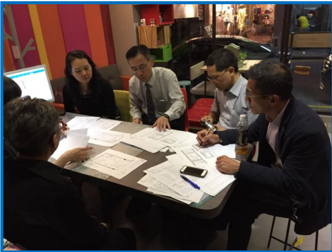
The Renovation Team meeting with contractors