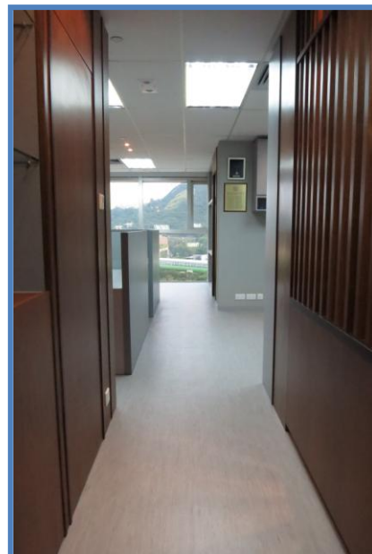
A full view of the office