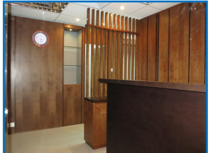
Newly designed entrance and reception