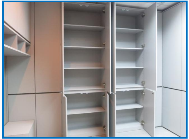
Plenty of storage space