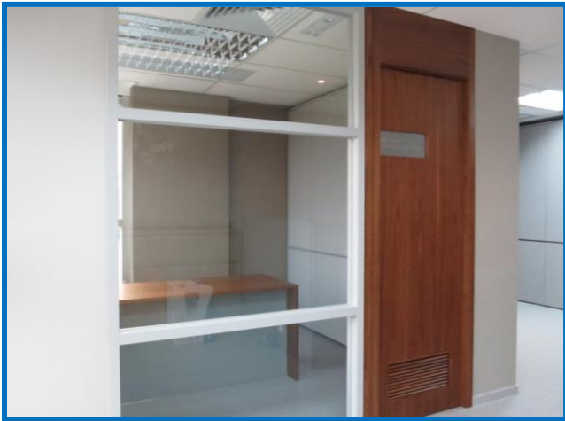
Senior Executive Officer room