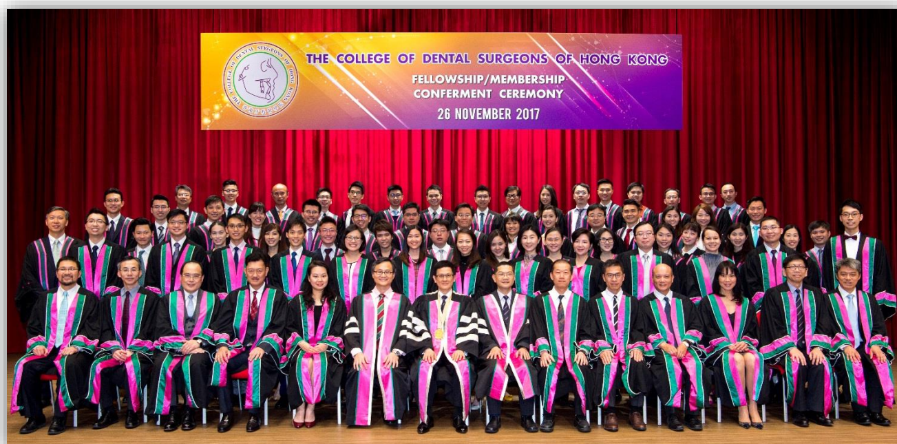
New Fellows and Members with Council Members at the Conferment Ceremony held on 26 November 2017