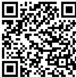
QR code (Android)