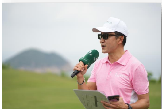
The HKACS's Charity Golf Tournament is a significant charity event to support the Charity Bed Programme.

In 2014/15, I became an Executive Committee member, allowing me to actively contribute to shaping HKACS's strategies and policies. As my dedication and passion grew, I was humbled to be appointed as the Vice Chairman in 2021/22, where I could lead and collaborate with like-minded individuals for a cause close to my heart.